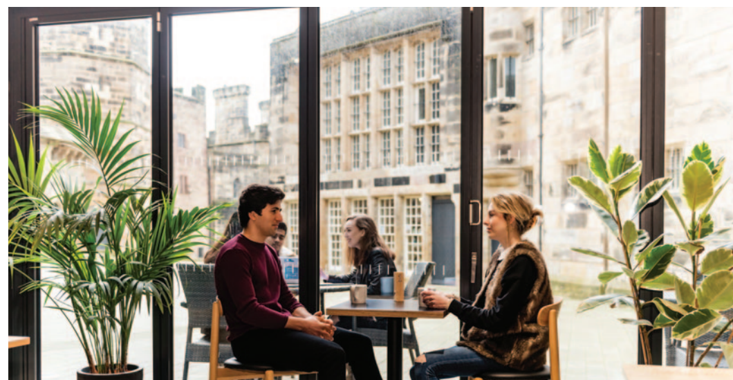
The Castle Cafe – Lancaster Castle